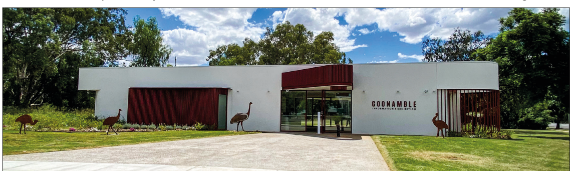
Dad Emu grazes his chicks on the lawns of the new Coonamble Information and Exhibition Centre.